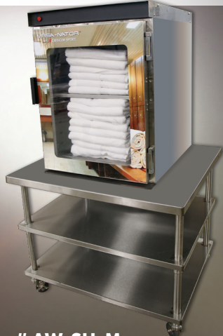
# AW-SH-M (Optional stand available)

DRASTICALLY REDUCES the risk of contamination from MRSA and other infectious viruses and bacterias.