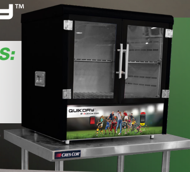
# QD4P (Optional stand available)

Shoes, Gloves, Hand Towels, and Athletic Equipment